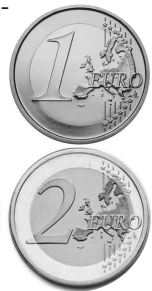
€1 & €2 Euro coins each in 2 colors

Avoid carrying just US dollar cash. Changing dollars to Euros can be difficult, time-consuming or expensive because the typical hotel or "Bureau de Change" may show a good rate but then once you work your way up in line, you see that they charge a 9.9% fee! Sure, bring some dollars for your flight days' expenses at US airports. But best to get some Euros before departure (some US banks sell Euros) or soon after arrival.