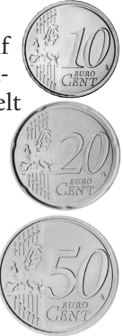
Gold Euro cents, tens

Lately a Euro (€1) has been worth about $1.10 to $1.12 in US dollars (see inside back cover for a chart). Even if